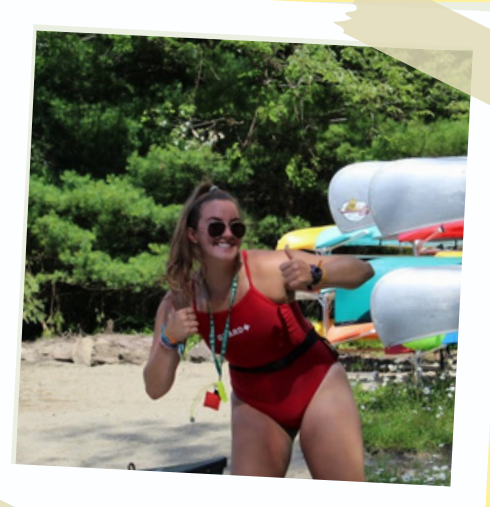
Staff Summers 2019 --